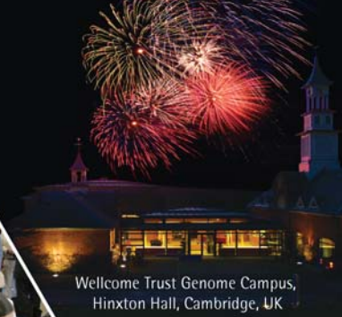
Wellcome Trust Genome Campus, Hinxtton Hall, Cambridge, UK